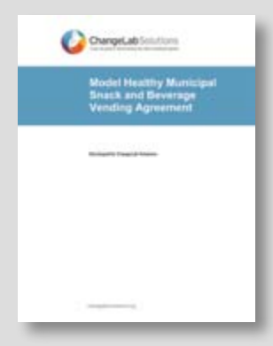
Model Healthy Municipal Snack and Beverage Vending Agreement